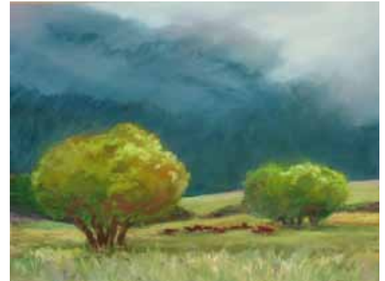
September Storm Over the Collegiate Range by Lana Woodruff

Buena Vista/Salida plein air festival and also won third place at the PPPS Fountain Valley School exhibit.