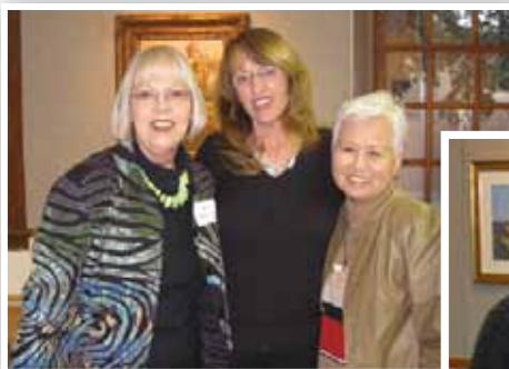
Photos from the Fountain Valley Art Exhibit.