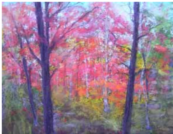
Pure Color by Lynn Chapman