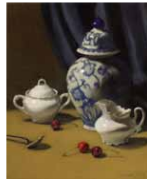
Three Cherries by Pamela Poll