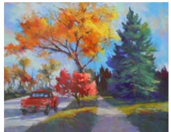
Red Pickup by Fran Dodd