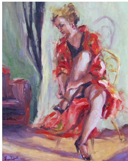
Night on the Town , 20 x 16 oil Currently being shown in Representing the West Exhibit, Sangre de Cristo Art Center

Meet for lunch afterward at Phantom Canyon, across Cascade Street from the library.